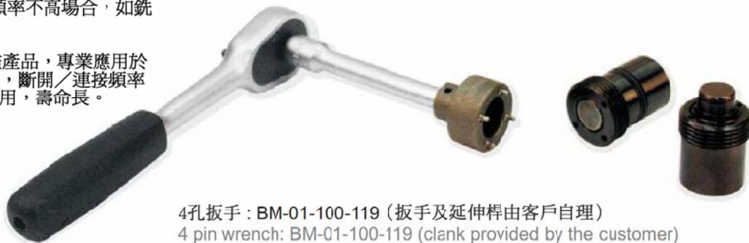
4孔扳手：BM-01-100-119（扳手及延伸桿由客戶自理） 4 pin wrench: BM-01-100-119 (clank provided by the customer) 優點：節省空間，作動精準靈敏，高頻率高效能，耐用壽命長

85 系列 - 獨家設計，旗艦產品，專業應用於工具交換系統盤，斷開/連接頻率高，比57系列耐用，壽命長。