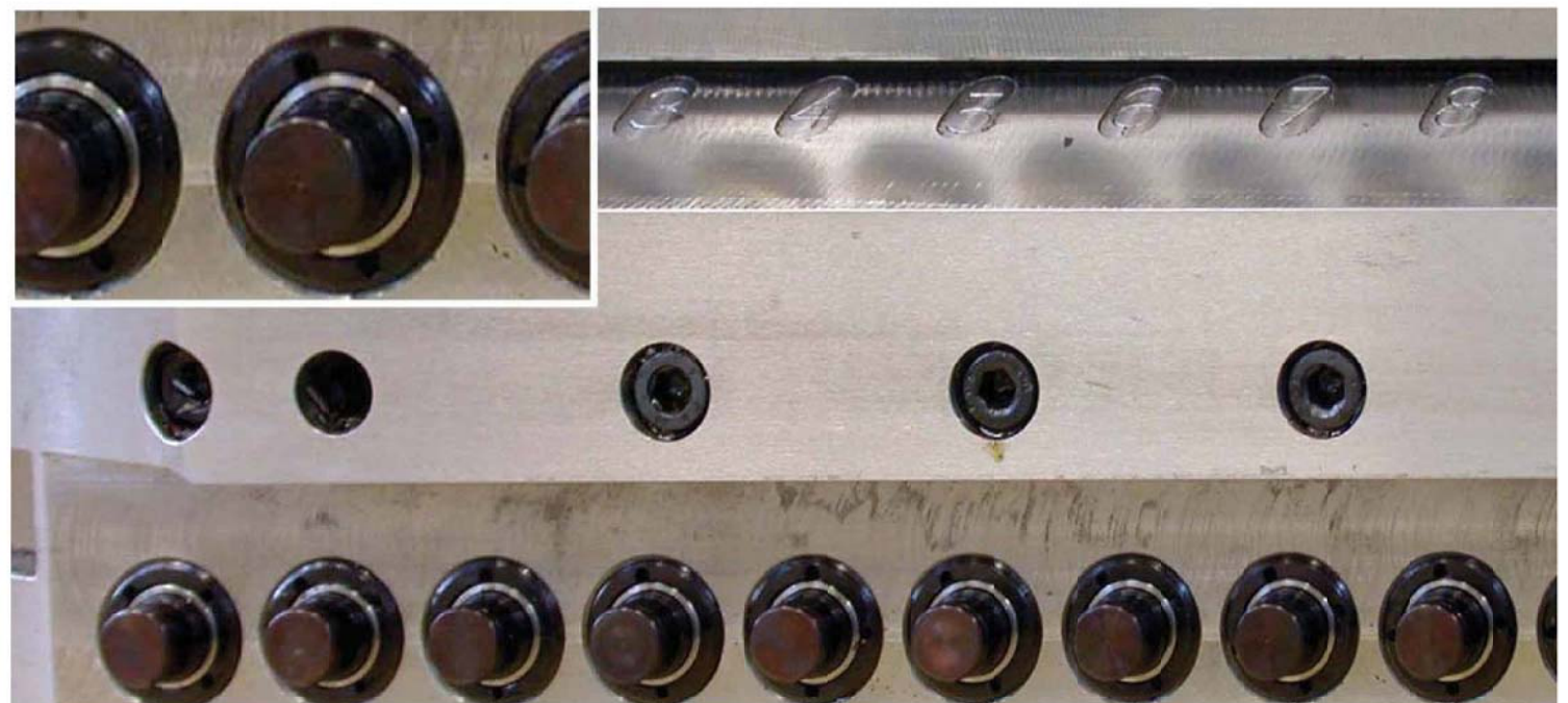
Verschlussnippel, Self sealing adaptor Type 85-006